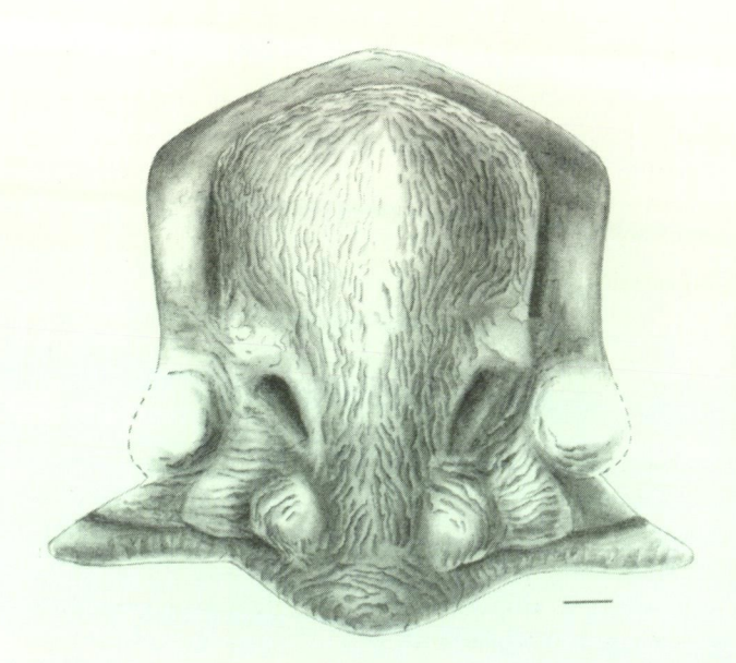
Figure 3 Norasaphus (Shergoldina) greenvalensis sp.nov. Reconstruction of the cranidium. Bar scale: 1 mm.